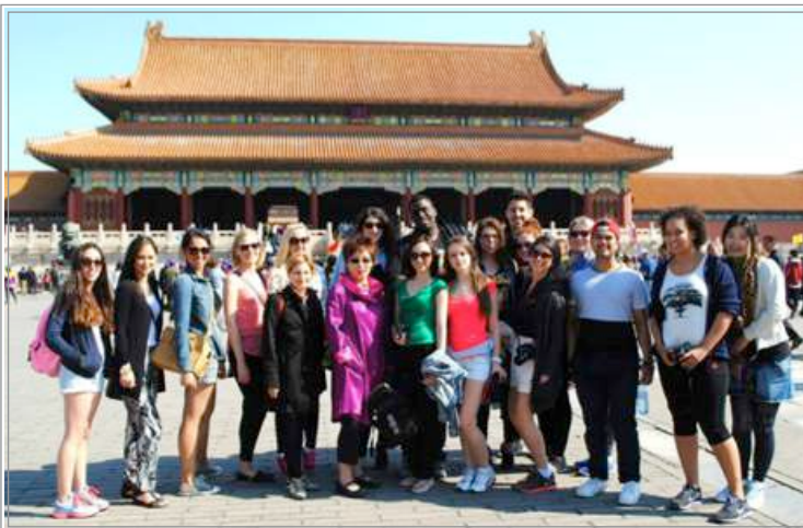
RMG917 class visited the Forbidden City-the imperial places of the Ming and Qing Dynasties