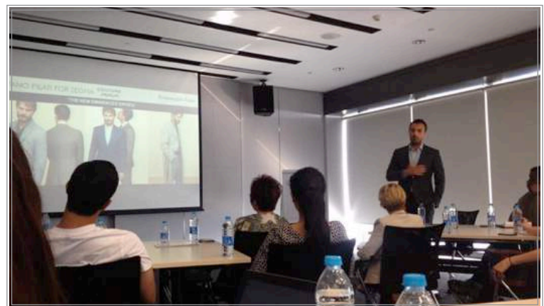
The group visited Ermenegildo Zegna's head office in Shanghai