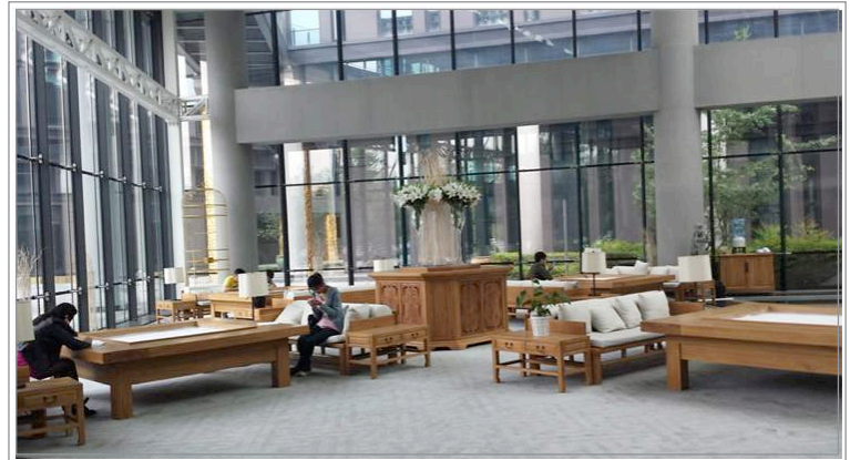
The group visited NetEase, a high tech company in China. The picture shows the main foyer of NetEase

Each student wrote a final report upon completion of the trip. The report focuses on the culture and retail markets in China, including consumer behaviour, competitive strategies, the potential to succeed and challenges faced by both retail and wholesale companies.