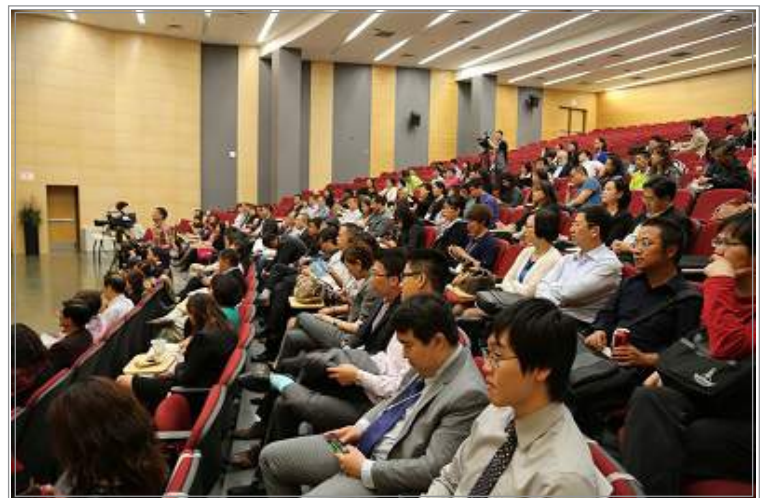
More than 300 people took part in the Forum.

Among enthusiastic audience of 300 plus attendees were entrepreneurs, community leaders, business service providers as well as students, including a group of MBA students who drove from Queen's University just for the event. The Forum was co-organized by the Center for Chinese Entrepreneurship, Tsinghua University, the Canada-China Institute for Business & Development at TRSM, and the Chinese Institute for Overseas Chinese History Studies.