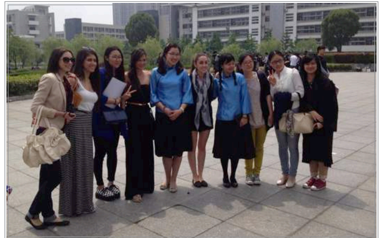
Ryerson University students with students from Zhejiang Gongshang University